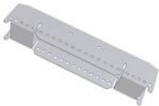
TLWHE/CPL Coupling joint kit