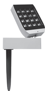
AC037 EARTH SPIKE