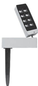
AC037 EARTH SPIKE